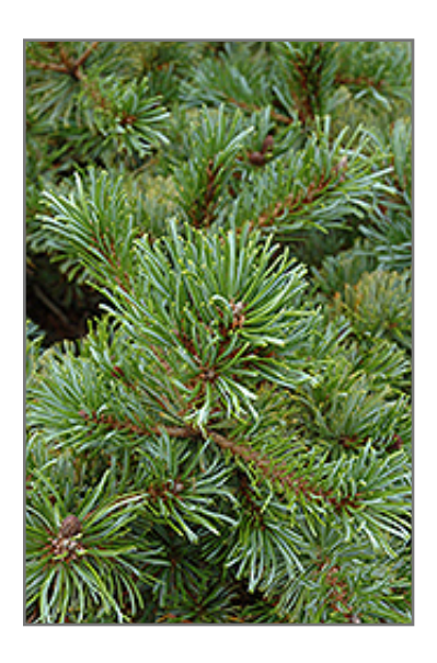
Jeddeloh Japanese Stone Pine foliage

Jeddeloh Japanese Stone Pine is recommended for the following landscape applications;