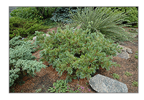
Jeddeloh Japanese Stone Pine

This is a relatively low maintenance shrub. When pruning is necessary, it is recommended to only trim back the new growth of the current season, other than to remove any dieback. It has no significant negative characteristics.