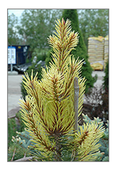
Taylor's Sunburst Lodgepole Pine foliage