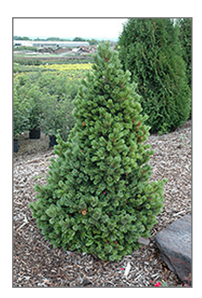
Sherwood Compact Bristlecone Pine

Sherwood Compact Bristlecone Pine will grow to be about 4 feet tall at maturity, with a spread of 3 feet. It has a low canopy. It grows at a slow rate, and under ideal conditions can be expected to live to a ripe old age of 300 years or more; think of this as a heritage shrub for future generations!