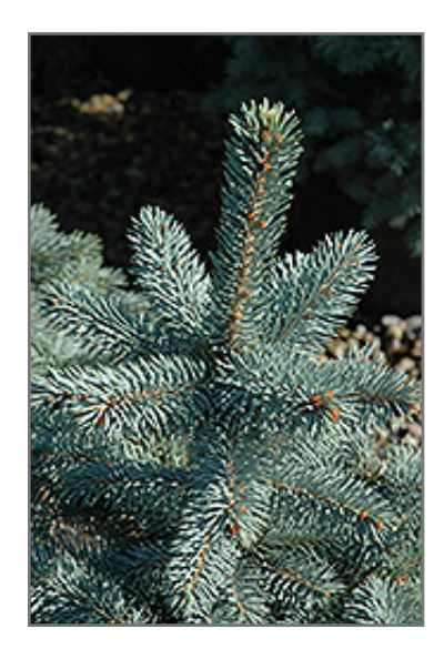
Baby Blue Eyes Spruce foliage