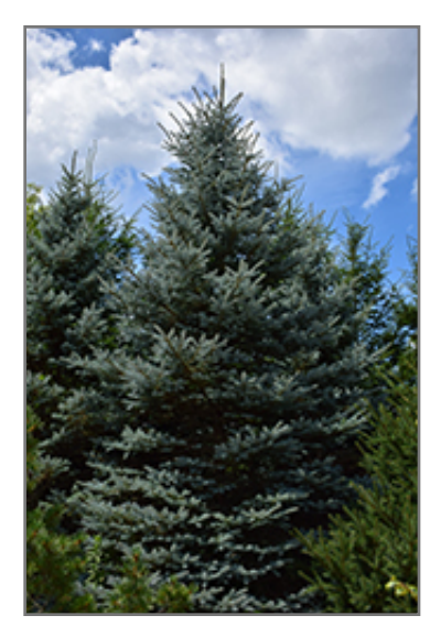
Baby Blue Eyes Spruce

Baby Blue Eyes Spruce is recommended for the following landscape applications;