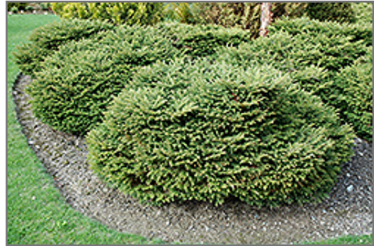
Creeping Norway Spruce