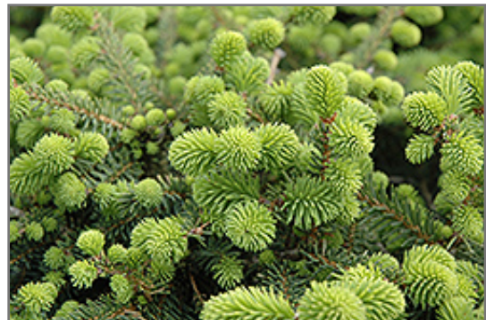
Creeping Norway Spruce foliage