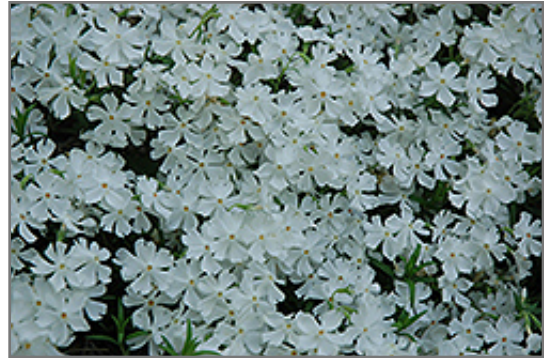
Whiteout Moss Phlox flowers