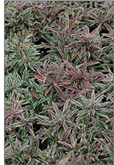
Variegated Creeping Phlox foliage