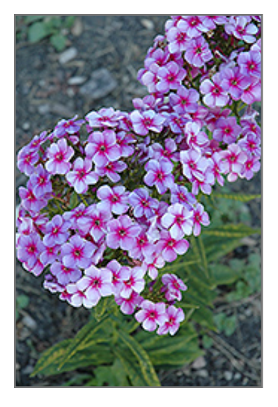
Swirly Burly Garden Phlox flowers

Swirly Burly Garden Phlox features bold fragrant conical lavender star-shaped flowers with violet eyes at the ends of the stems from early summer to early fall. The flowers are excellent for cutting. Its narrow leaves remain green in colour throughout the season.