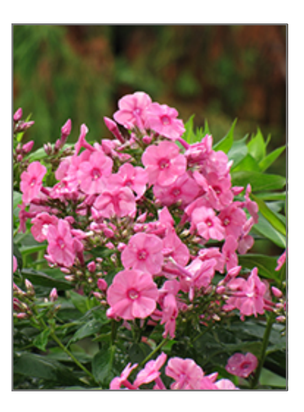
Shortwood Garden Phlox flowers