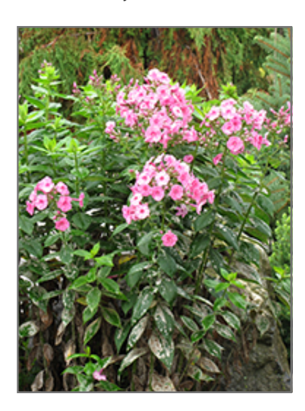
Shortwood Garden Phlox in bloom