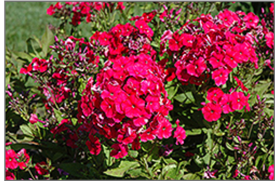
Miss Mary Garden Phlox flowers