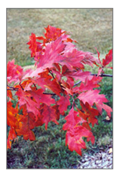
Red Oak in fall

This tree should only be grown in full sunlight. It prefers to grow in average to moist conditions, and shouldn't be allowed to dry out. It is not particular as to soil type, but has a definite preference for acidic soils, and is subject to chlorosis (yellowing) of the foliage in alkaline soils. It is highly tolerant of urban pollution and will even thrive in inner city environments. This species is native to parts of North America.