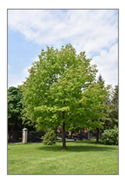
Red Oak

Red Oak is recommended for the following landscape applications;