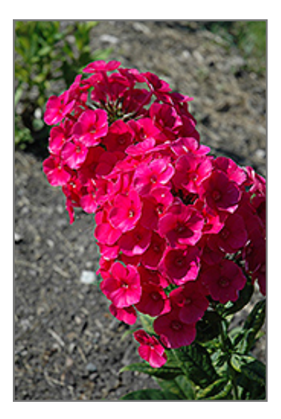
Grenadine Dream Garden Phlox flowers

Grenadine Dream Garden Phlox features bold fragrant conical ruby-red star-shaped flowers at the ends of the stems from early summer to early fall. The flowers are excellent for cutting. Its narrow leaves remain green in colour throughout the season.