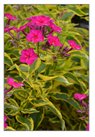
Goldmine Garden Phlox flowers

Goldmine Garden Phlox features bold fragrant conical ruby-red star-shaped flowers at the ends of the stems from early summer to early fall. The flowers are excellent for cutting. Its attractive narrow leaves remain green in colour with showy gold variegation throughout the season.