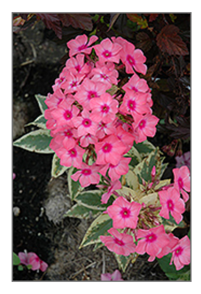
Becky Towe Garden Phlox flowers

Becky Towe Garden Phlox features bold fragrant conical salmon star-shaped flowers with fuchsia eyes at the ends of the stems from early to late summer. The flowers are excellent for cutting. Its attractive narrow leaves remain green in colour with showy yellow variegation throughout the season.