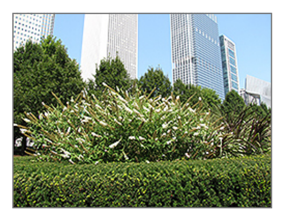
White Profusion Butterfly Bush in bloom

White Profusion Butterfly Bush is recommended for the following landscape applications;