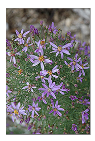
Dwarf Rhone Aster flowers