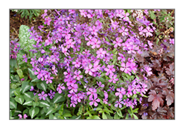
Plum Perfect Phlox flowers