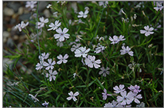
Sand Phlox flowers