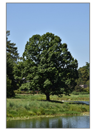
English Oak