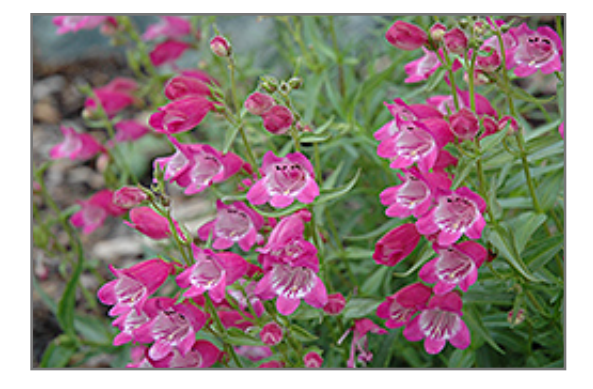
Red Rocks Beard Tongue flowers

Plant Height: 18 inches Flower Height: 24 inches Spread: 18 inches Spacing: 14 inches Sunlight: O Hardiness Zone: 5a Other Names: Beardtongue