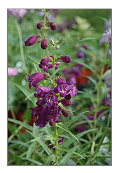
Pike's Peak Purple Beard Tongue flowers