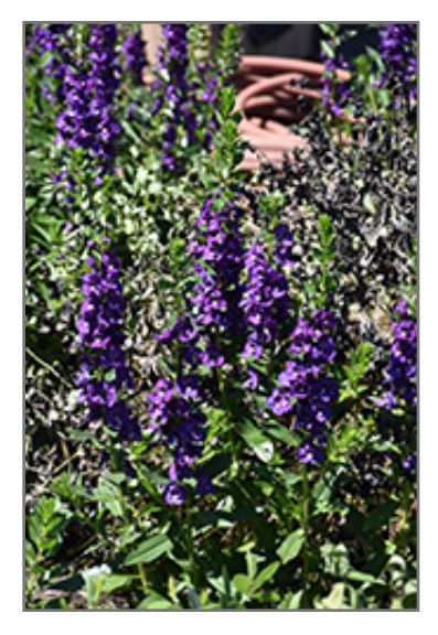
Pike's Peak Purple Beard Tongue flowers