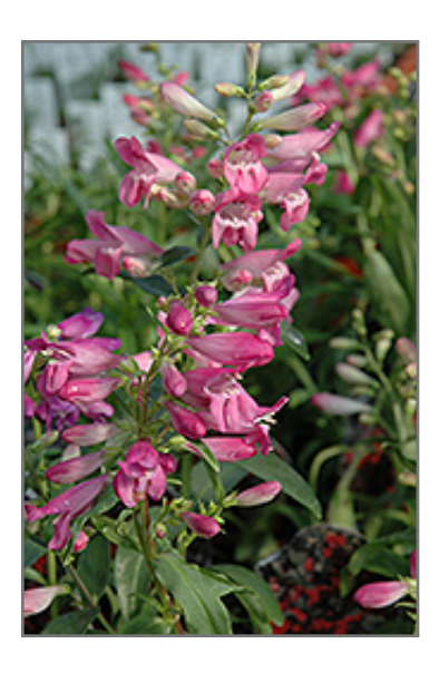
Dwarf Rondo Mix Beard Tongue flowers

Dwarf Rondo Mix Beard Tongue has masses of beautiful spikes of pink tubular flowers with white throats rising above the foliage from late spring to mid summer, which are most effective when planted in groupings. The flowers are excellent for cutting. Its narrow leaves remain green in colour throughout the season.