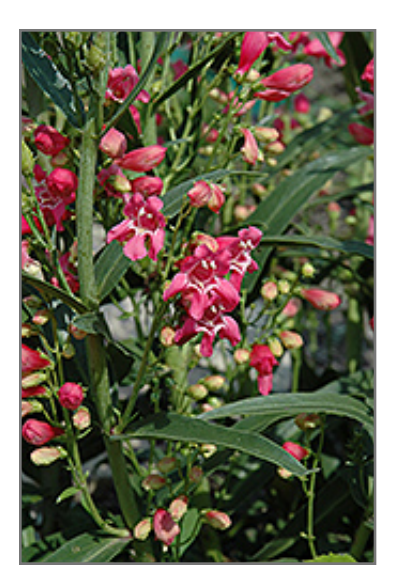
Cambridge Mix Beard Tongue flowers

Cambridge Mix Beard Tongue has masses of beautiful spikes of rose tubular flowers rising above the foliage from late spring to mid summer, which are most effective when planted in groupings. The flowers are excellent for cutting. Its narrow leaves remain grayish green in colour throughout the season.