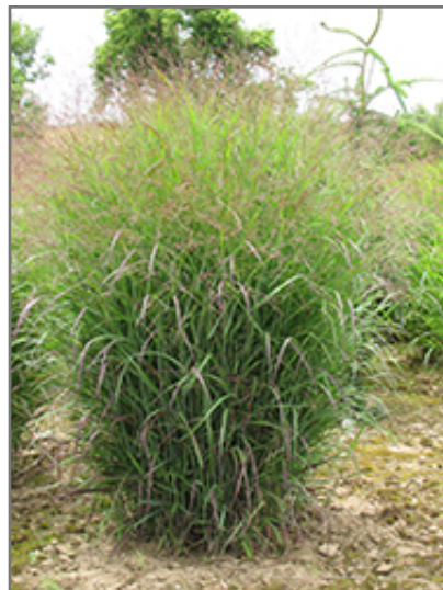
Prairie Sky Switch Grass

Prairie Sky Switch Grass features airy plumes of rose flowers rising above the foliage in mid summer. Its attractive grassy leaves are steel blue in colour. As an added bonus, the foliage turns a gorgeous gold in the fall. The brick red seed heads are carried on showy plumes displayed in abundance from late summer to mid fall. The tan stems can be quite attractive.