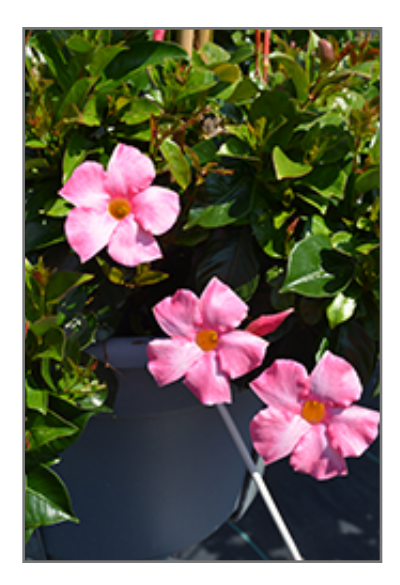
Flordenia Rose Mandevilla flowers

Early blooming with some cold tolerance; A lovely bushy variety with rose-pink blooms over lush, glossy green foliage; pinch to encourage branching and to maintain bushy habit; an excellent choice for garden beds or patio containers