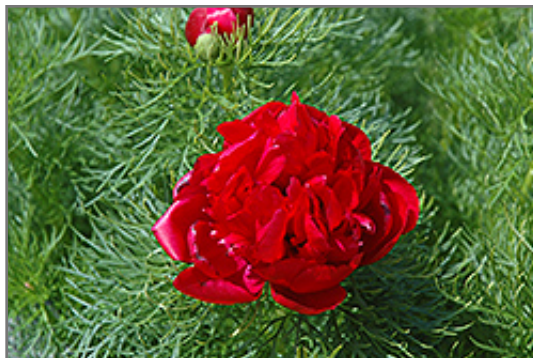
Double Fernleaf Peony flowers