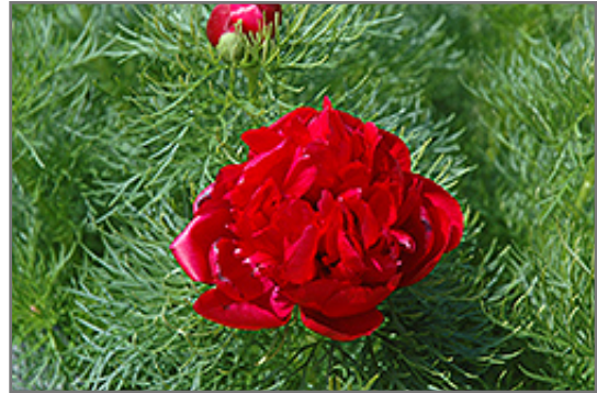
Double Fernleaf Peony flowers