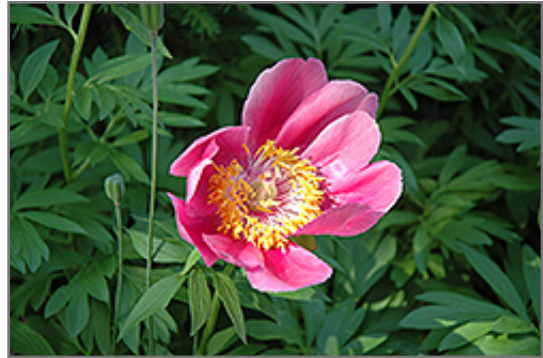
Thumbelina Peony flowers