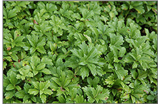
Kingswood Japanese Spurge foliage

Kingswood Japanese Spurge will grow to be about 12 inches tall at maturity, with a spread of 24 inches. Its foliage tends to remain dense right to the ground, not requiring facer plants in front. It grows at a slow rate, and under ideal conditions can be expected to live for approximately 20 years. As an evergreen perennial, this plant will typically keep its form and foliage year-round.