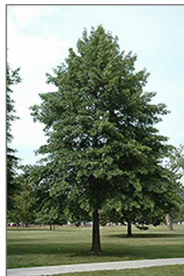
Pin Oak