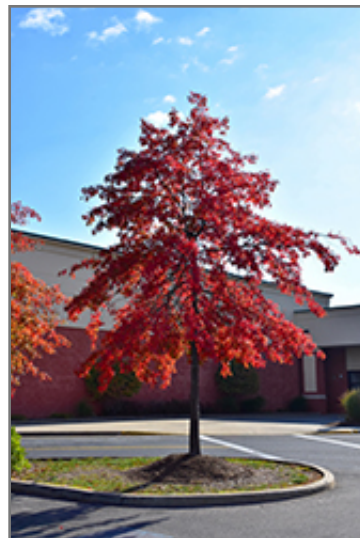
Pin Oak in fall

Pin Oak is recommended for the following landscape applications;