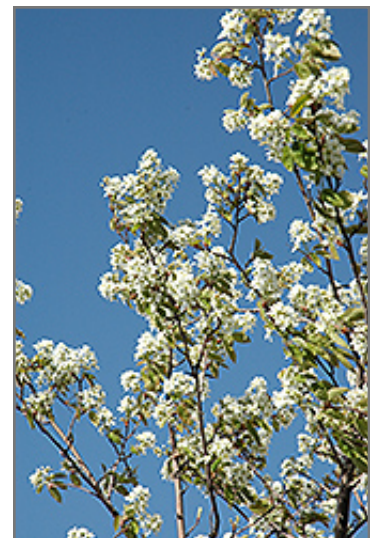
Allegheny Serviceberry flowers