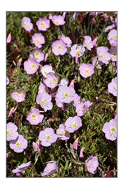
Evening Primrose flowers