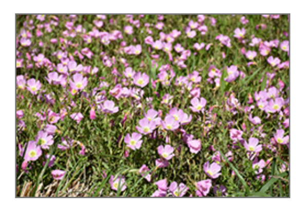
Evening Primrose flowers

Evening Primrose will grow to be about 12 inches tall at maturity, with a spread of 30 inches. When grown in masses or used as a bedding plant, individual plants should be spaced approximately 26 inches apart. Its foliage tends to remain dense right to the ground, not requiring facer plants in front. It grows at a fast rate, and under ideal conditions can be expected to live for approximately 10 years. As an herbaceous perennial, this plant will usually die back to the crown each winter, and will regrow from the base each spring. Be careful not to disturb the crown in late winter when it may not be readily seen!