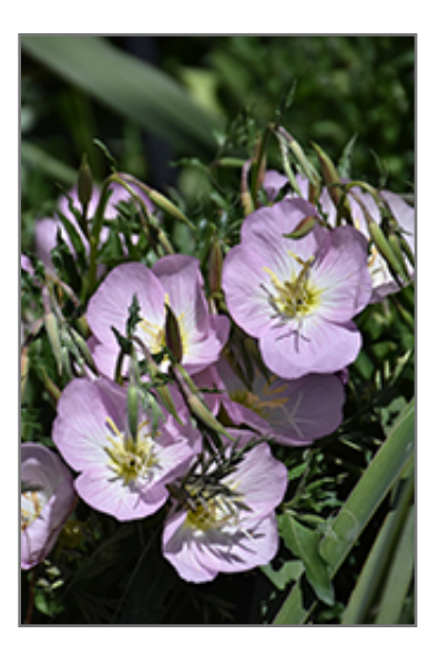
Evening Primrose flowers

Evening Primrose is recommended for the following landscape applications;