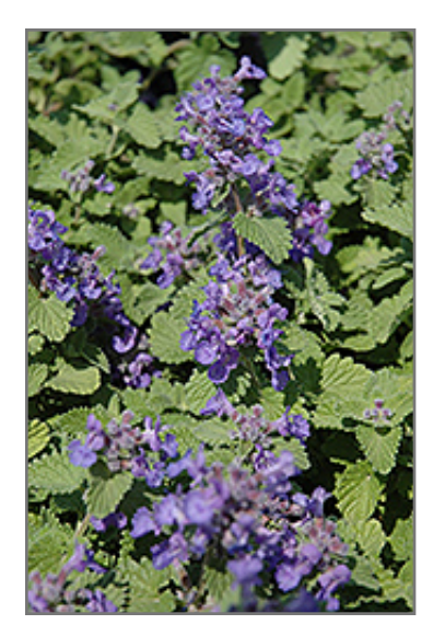
Little Titch Catmint flowers