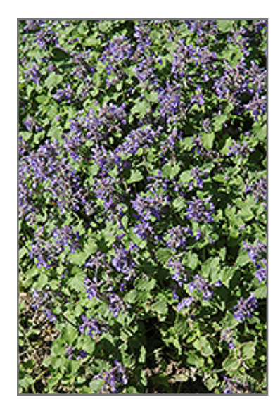
Little Titch Catmint in bloom