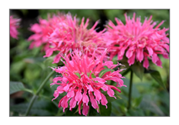
Coral Reef Beebalm flowers

Coral Reef Beebalm is recommended for the following landscape applications: