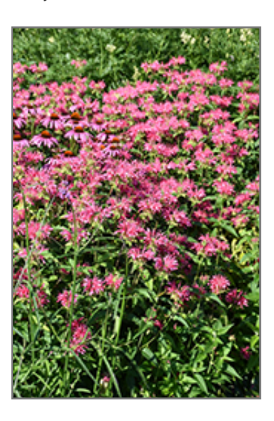
Coral Reef Beebalm flowers