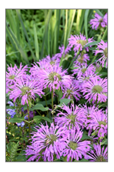
Petite Wonder Beebalm flowers

Petite Wonder Beebalm has masses of beautiful clusters of fragrant pink flowers at the ends of the stems from mid to late summer, which are most effective when planted in groupings. Its fragrant pointy leaves remain forest green in colour throughout the season.