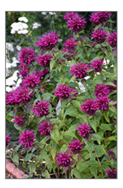
Grand Parade Beebalm flowers