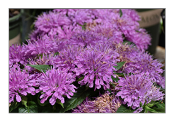
Grand Parade Beebalm flowers

Grand Parade Beebalm is recommended for the following landscape applications;