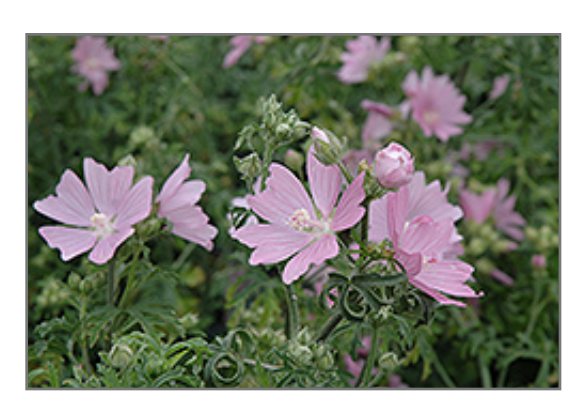
Upright Hollyhock Mallow flowers

Upright Hollyhock Mallow has masses of beautiful pink round flowers at the ends of the stems from mid summer to early fall, which are most effective when planted in groupings. Its deeply cut lobed leaves remain green in colour throughout the season.