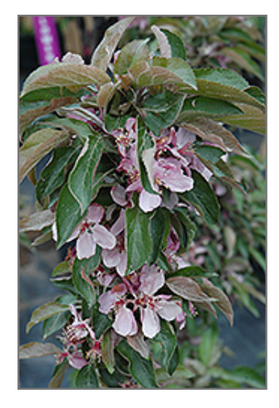
Dreamweaver Flowering Crab flowers

Dreamweaver Flowering Crab is recommended for the following landscape applications;