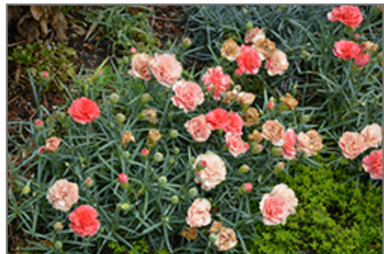
Odessa Orange Bling Bling Carnation in bloom