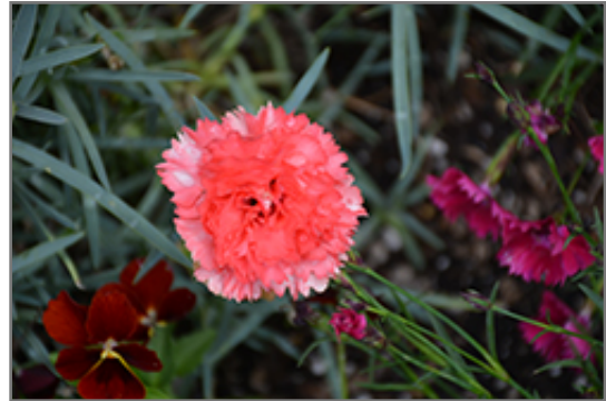
Odessa Orange Bling Bling Carnation flowers

Odessa Orange Bling Bling Carnation is recommended for the following landscape applications;