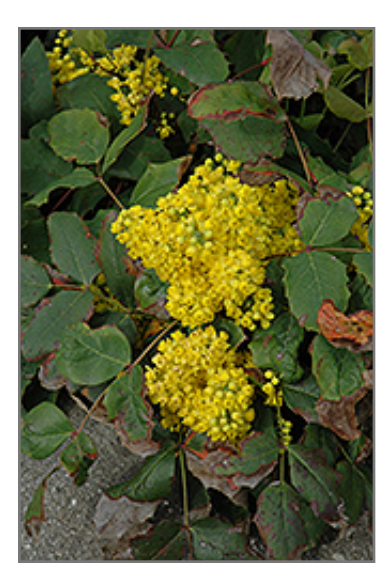
Creeping Mahonia flowers

This shrub will require occasional maintenance and upkeep, and can be pruned at anytime. Deer don't particularly care for this plant and will usually leave it alone in favor of tastier treats. Gardeners should be aware of the following characteristic(s) that may warrant special consideration;