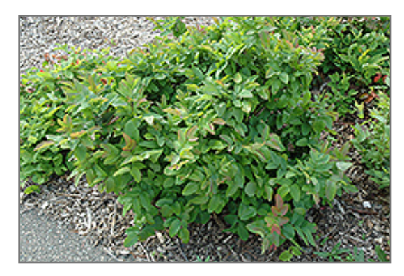
Creeping Mahonia