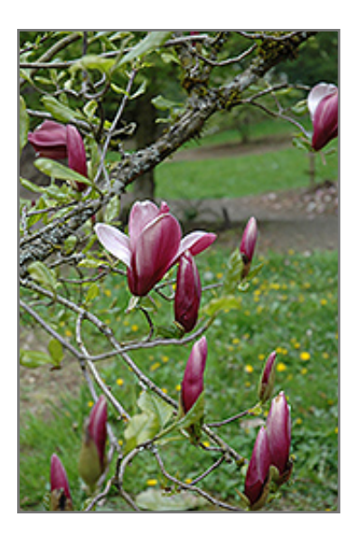
O'Neill Lily Magnolia flowers