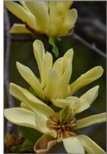
Butterflies Magnolia flowers

This tree does best in full sun to partial shade. It requires an evenly moist well-drained soil for optimal growth, but will die in standing water. It is not particular as to soil type, but has a definite preference for acidic soils. It is quite intolerant of urban pollution, therefore inner city or urban streetside plantings are best avoided. Consider applying a thick mulch around the root zone in winter to protect it in exposed locations or colder microclimates. This particular variety is an interspecific hybrid.