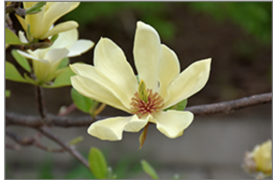
Butterflies Magnolia flowers