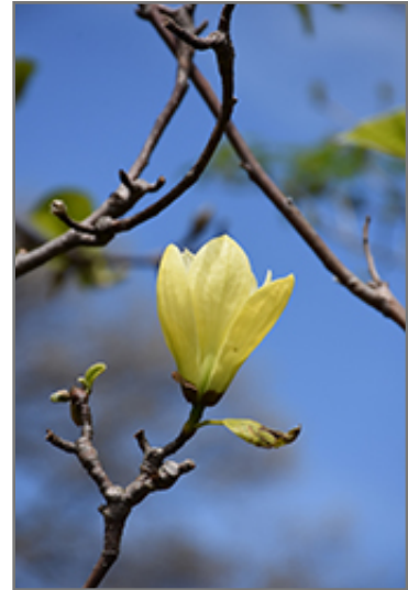
Butterflies Magnolia flowers

This tree does best in full sun to partial shade. It requires an evenly moist well-drained soil for optimal growth, but will die in standing water. It is not particular as to soil type, but has a definite preference for acidic soils. It is quite intolerant of urban pollution, therefore inner city or urban streetside plantings are best avoided. Consider applying a thick mulch around the root zone in winter to protect it in exposed locations or colder microclimates. This particular variety is an interspecific hybrid.