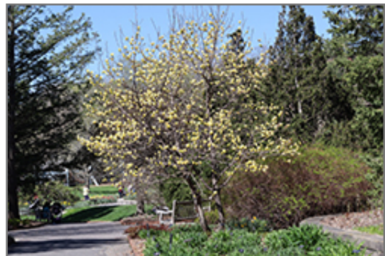
Butterflies Magnolia in bloom