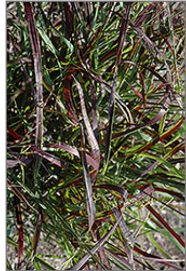
Blood Brothers Red Switch Grass foliage