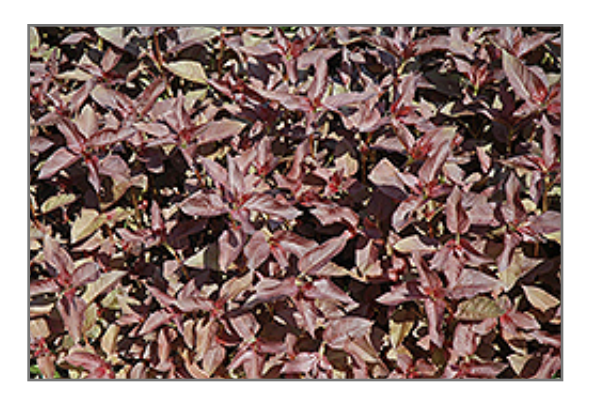
Purpleleaf Loosestrife foliage

Purpleleaf Loosestrife is a dense herbaceous perennial with an upright spreading habit of growth. Its relatively fine texture sets it apart from other garden plants with less refined foliage.