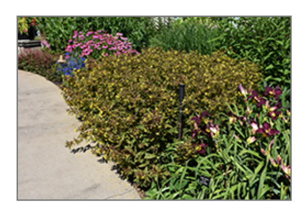
Purpleleaf Loosestrife in bloom

This is a high maintenance plant that will require regular care and upkeep, and is best cleaned up in early spring before it resumes active growth for the season. It is a good choice for attracting butterflies to your yard. Gardeners should be aware of the following characteristic(s) that may warrant special consideration;