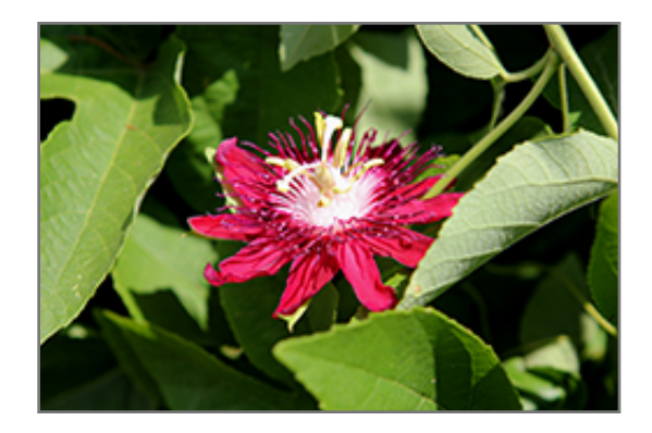
Red Passion Flower flowers

This plant does best in full sun to partial shade. It does best in average to evenly moist conditions, but will not tolerate standing water. To help this plant achive its best flowering performance, periodically apply a flower-boosting fertilizer from early spring through into the active growing season. It is not particular as to soil type, but has a definite preference for alkaline soils. It is somewhat tolerant of urban pollution. Consider applying a thick mulch around the root zone in winter to protect it in exposed locations or colder microclimates. This species is not originally from North America.