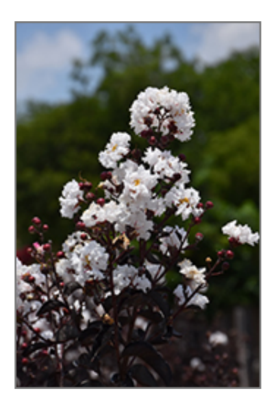
Thunderstruck White Lightning Crapemyrtle flowers