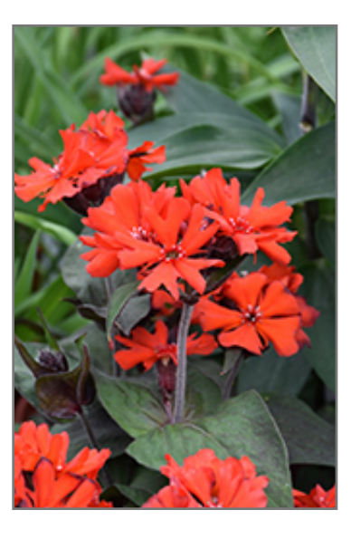
Molten Lava Campion flowers

Molten Lava Campion has masses of beautiful scarlet star-shaped flowers at the ends of the stems from early to mid summer, which are most effective when planted in groupings. Its attractive pointy leaves remain burgundy in colour with distinctive coppery-bronze edges throughout the season. The black stems are very colorful and add to the overall interest of the plant.