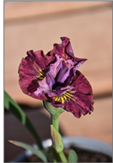
Miss Apple Siberian Iris flowers