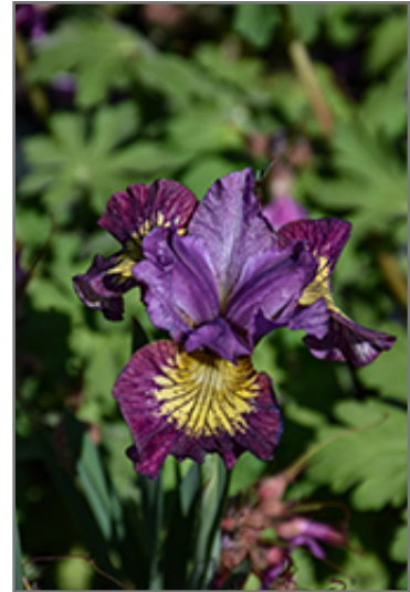
Miss Apple Siberian Iris flowers