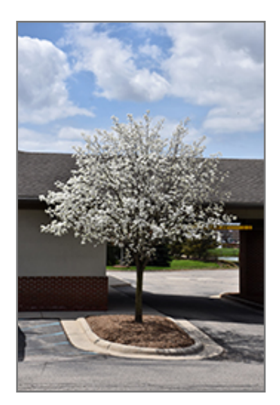
Callery Ornamental Pear in bloom