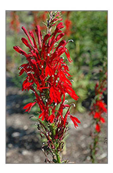
Cardinal Flower flowers