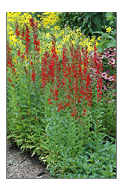
Cardinal Flower in bloom