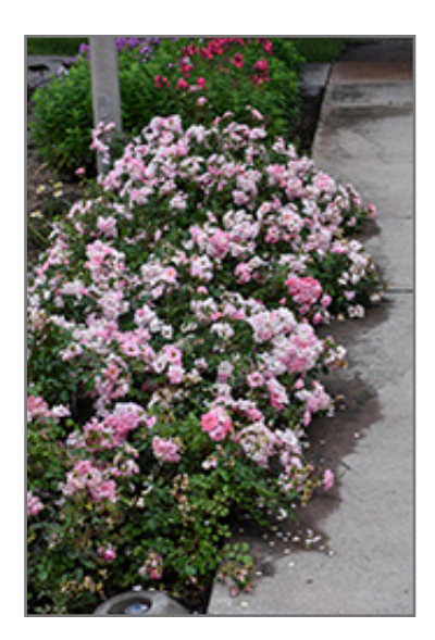
Blushing Drift Rose in bloom

Blushing Drift Rose is recommended for the following landscape applications;