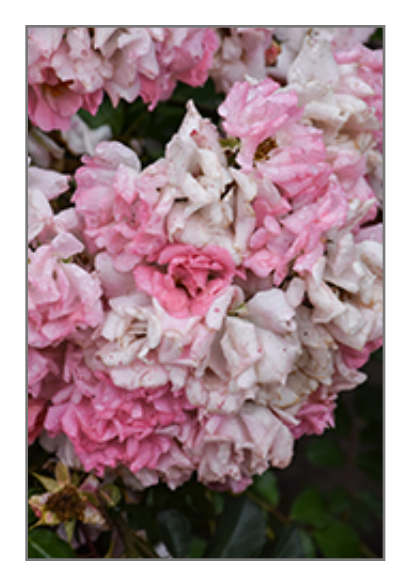
Blushing Drift Rose flowers